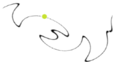
Figure 5.1: Representation of path of electron in Bohr model. The electron follows a precise path.

Most molecular modeling tools look to solve the Schrödinger Equation . This equation can be used to calculate an approximate idea of the behavior of electrons in an atom or molecule. The equation calculates the wavefunction of an electron, which is a mathematical description of the probability of an electron being at some location in relation to the nucleus of the atom. When this equation is calculated, chemists can determine the energy of the atom or molecule. Chemists can also use the calculation results to derive a wide variety of other properties or characteristics of the atom or molecule.